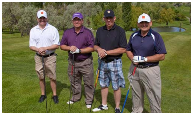
First place winners (above).

The day ended with a wonderful collection of raffle prizes. Yet again, another fine example of how SMPS rises to the occasion to make sure everyone enjoys their time together!